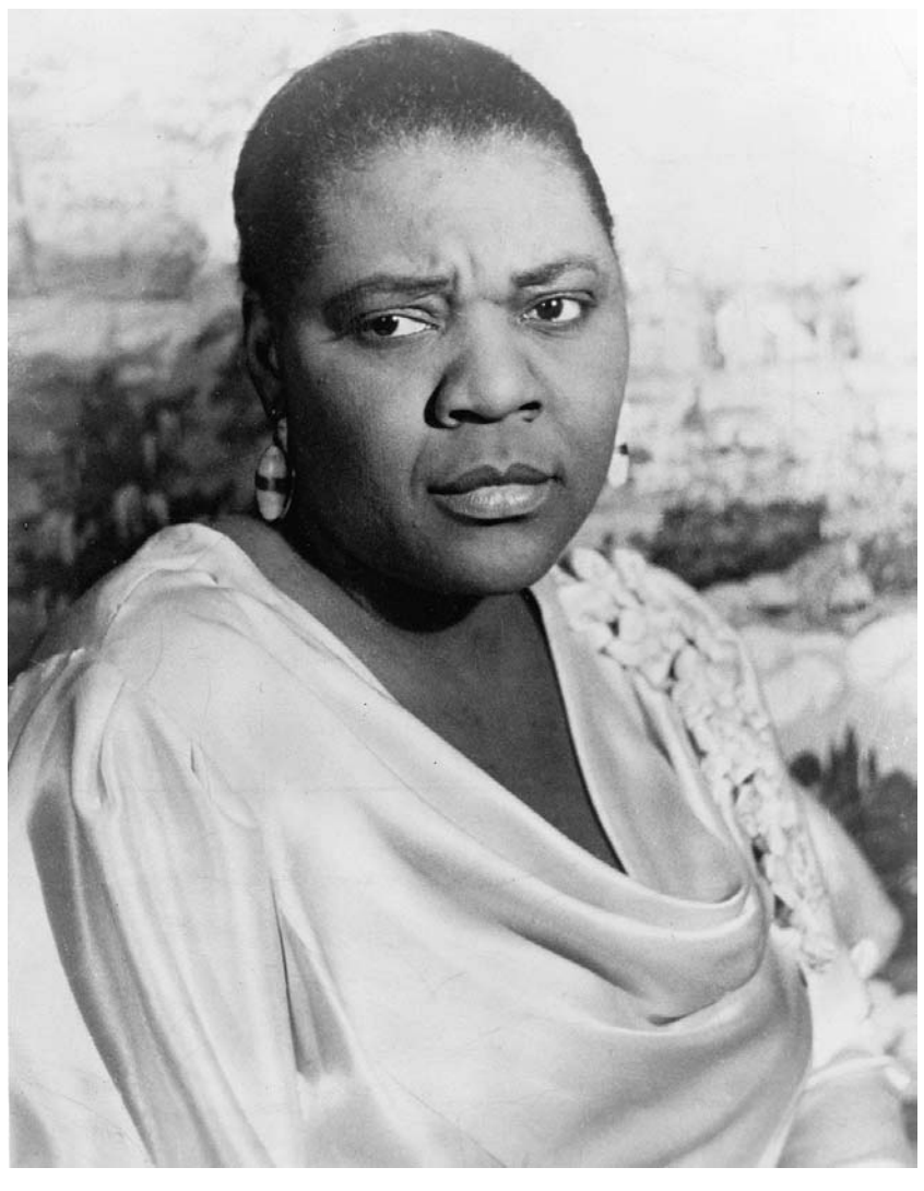
3 Bessie Smith, Late 1920s