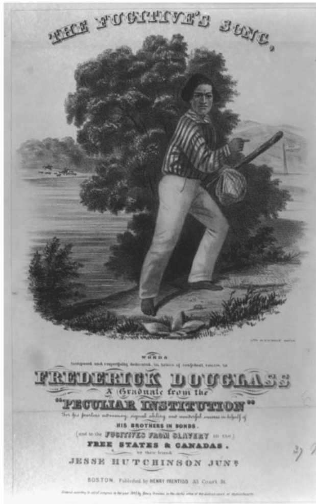
Photo 1.3. Sheet music inspired by Frederick Douglass’s Narrative , 1847.

scholar Chadwick Hansen has determined that the rowers—who were probably recent migrants from the West Indies—actually were using the African word to , of Kikongo origin, which generally means “body part or member” but specifically refers to “buttocks.” Jenny, in short, was not shaking her toe. The rowers’ “satisfaction,” relayed to Fanny Kemble’s party with “a good deal of dramatic and musical effect,” apparently derived from their covert expression of provocative female sexuality in front of a genteel white woman. 12