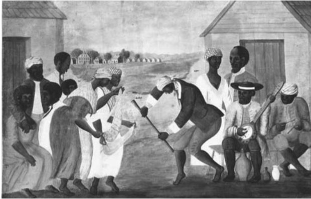
Photo A.1. The Old Plantation

Anonymous, The Old Plantation (circa 1790). The Abby Aldrich Rockefeller Folk Art Museum, The Colonial Williamsburg Foundation, Williamsburg, Va. Reprinted by permission.