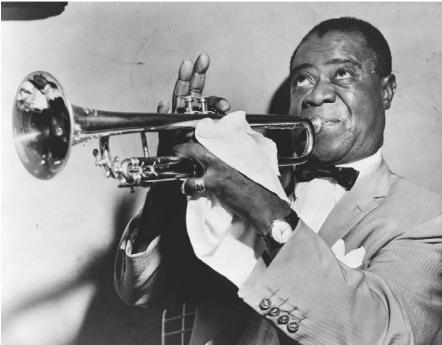
Photo 4.1. Louis Armstrong in the 1940s.

Louis Armstrong's story conveys much of the drama and excitement in the story of African Americans in jazz. Jazz is not purely a black music, but at every stage of its development the most significant innovators were African American. In addition, to an extent greater than in ragtime or the blues, jazz became the black musician's ticket to respect and prosperity in the eyes of the largely nonblack public, in the United States and in Europe. The rise of jazz took place during the tumultuous era of the two World Wars, which bookended the "roaring 1920s" and the era of the Great Depression. In those thirty years, from 1915 to 1945, the United States was transformed into a world power and a welfare state, in which the government committed itself to protecting its own needy citizens and the stability of the world. Americans' earlier concerns about local or re-