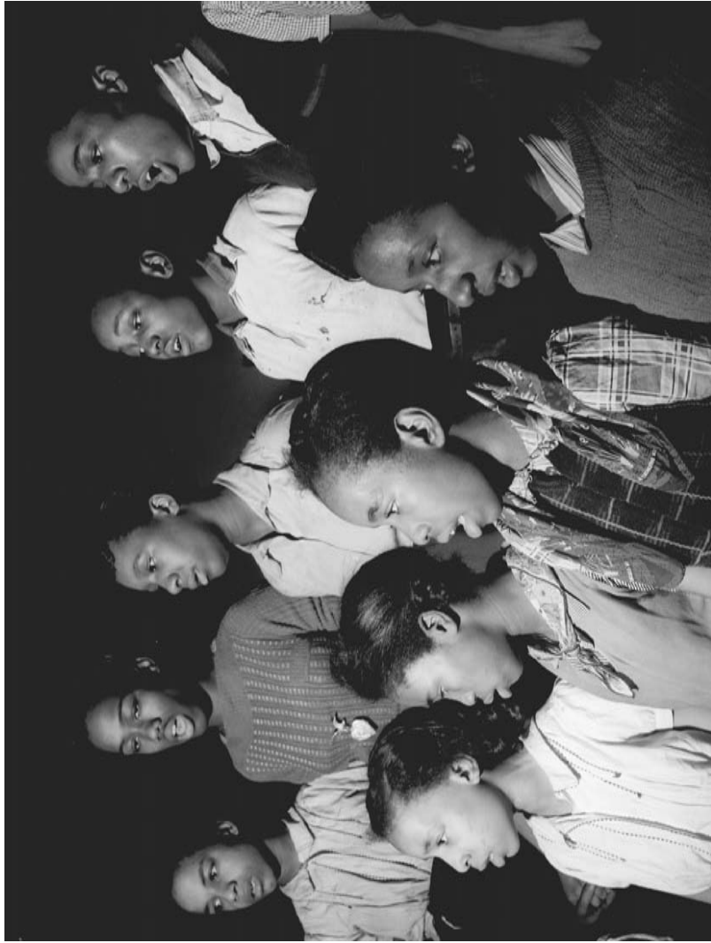
Photo 6.1. Children singing in the glee club of the Ida B. Wells housing project in Chicago, circa 1940. Glee clubs and church choirs maintained African American choral traditions.