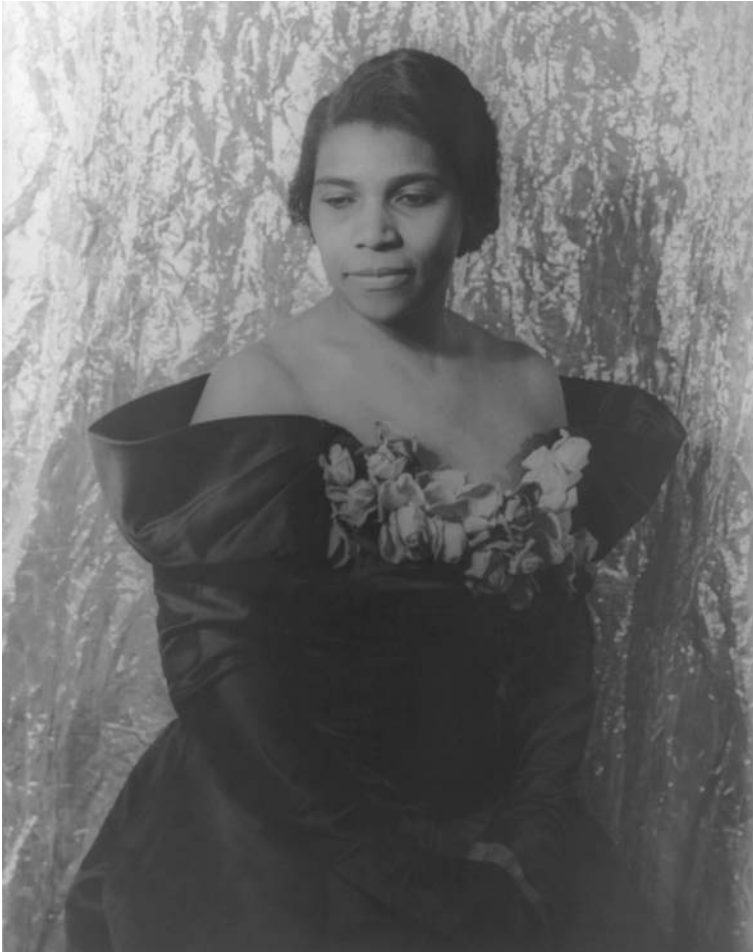
Photo 5.1. Contralto Marian Anderson, circa 1940.

prime, the company paid tribute to her stature by selecting her to break the color barrier, in a role in a production of Verdi's Un Ballo in Maschera .