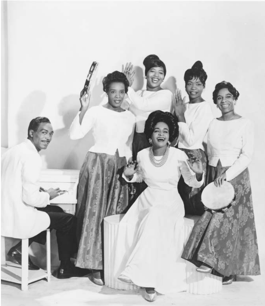
Photo 6.2. Publicity photo for the Clara Ward Singers, 1950s.

blues anticipated their use in rock 'n' roll music. Her playing resembled the band music of another pioneer of rock 'n' roll, the saxophonist and bandleader Louis Jordan, who had grown up in the same region of Arkansas. By 1948, Tharpe was overshadowed in the gospel field by new female stars, such as Clara Ward. An exuberant pianist and vocalist from Philadelphia, Ward toiled for years with a family-based choir until she became a success at National Baptist Convention meetings during World War II. In later years her ensemble became highly commercial, and in the 1960s it appeared in Las Vegas nightclubs and at Disneyland.