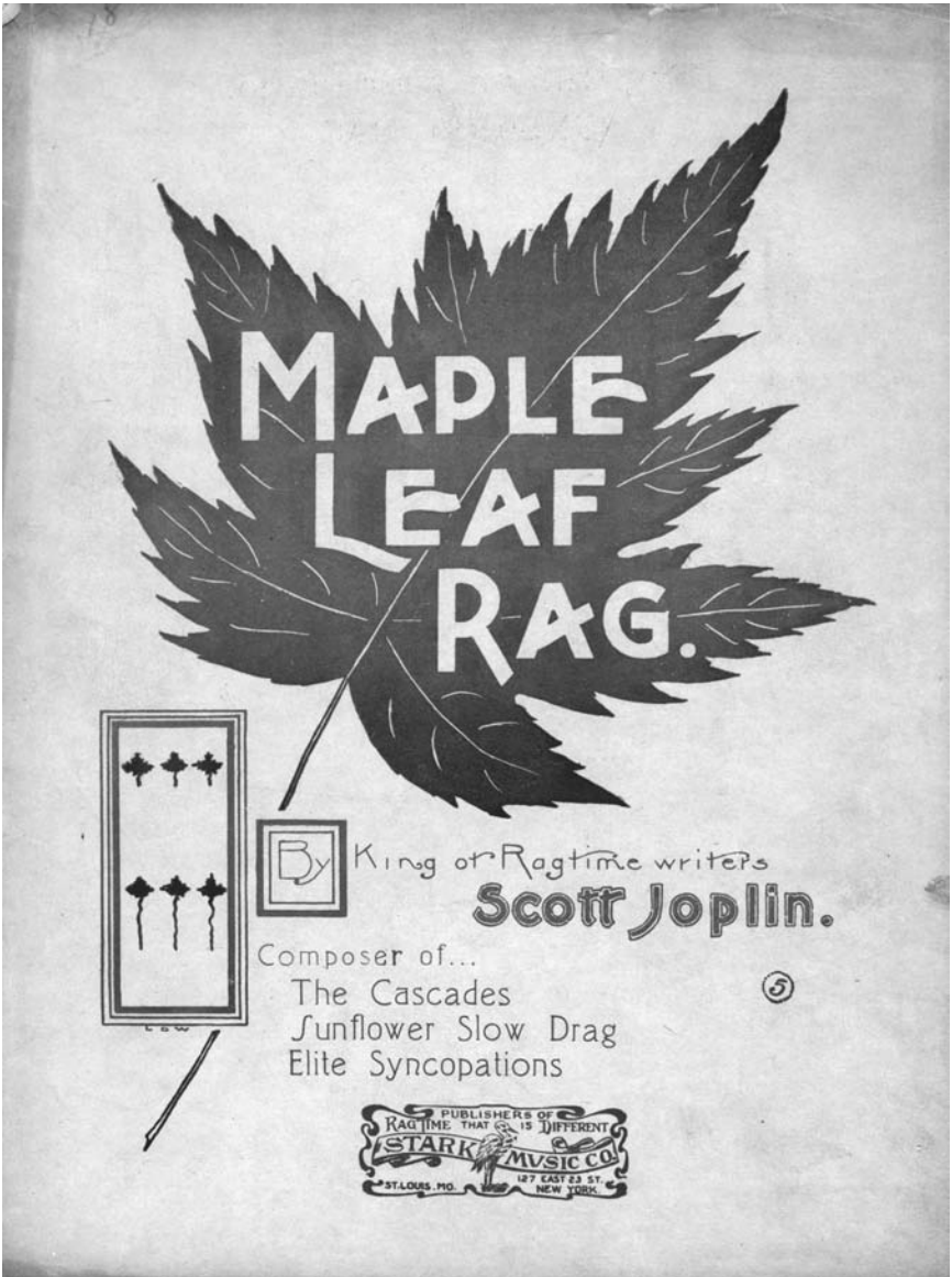
Photo 3.1. Sheet music cover, Maple Leaf Rag , 1899.