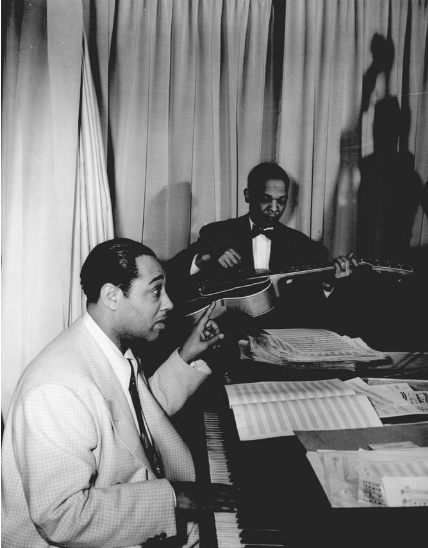
Photo 4.2. Composer and bandleader Edward Kennedy “Duke” Ellington performing in the early 1940s.

of biracial jazz. Other progressive-minded white leaders, such as Artie Shaw and Charlie Barnet, followed Goodman’s lead.