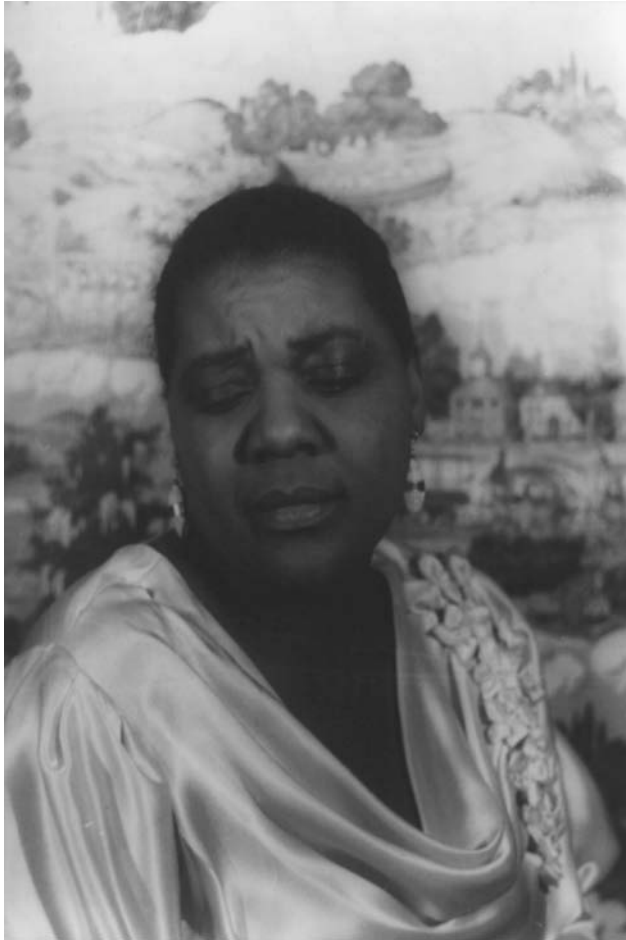
Photo 3.2. Blues singer Bessie Smith, photographed by Carl Van Vechten. Source: Prints and Photographs Division, Library of Congress.

duous tours, uncertain theater engagements, and low-royalty sheet music concerns that defined the musical profession. The African American church and its music increasingly were dominated by women, but, as in most white congregations, this dominance did little to pull women out of the traditional female domestic sphere. But black churchwomen usually worked outside the home as well, and their everyday difficulties, at the hands of society, their men, and their communities, became the subject matter of performances by female blues singers. The TOBA circuit and race records gave these singers prominent platforms for expressing the desires and troubles of a nation of black women, and the blues, abetted by