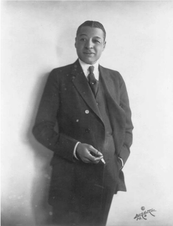
Photo 2.3. Entertainer Bert Williams.

these shows pianist J. Rosamond Johnson appeared with Cole in a stage act, dressed in white tie and black tails. The Johnson brothers, natives of Jacksonville, Florida, were well educated and committed to the advancement of black civil rights. James Weldon Johnson—a novelist, diplomat, and later the first black secretary of the National Association for the Advancement of Colored People (NAACP)—particularly embodied the post-Civil War generation’s dual commitment to authentic black artistic expression and the struggle for racial equality. In 1900, the Johnson brothers celebrated the anniversary of Lincoln’s birth by composing “Lift Every Voice and Sing,” a song that blended their musical and social concerns.