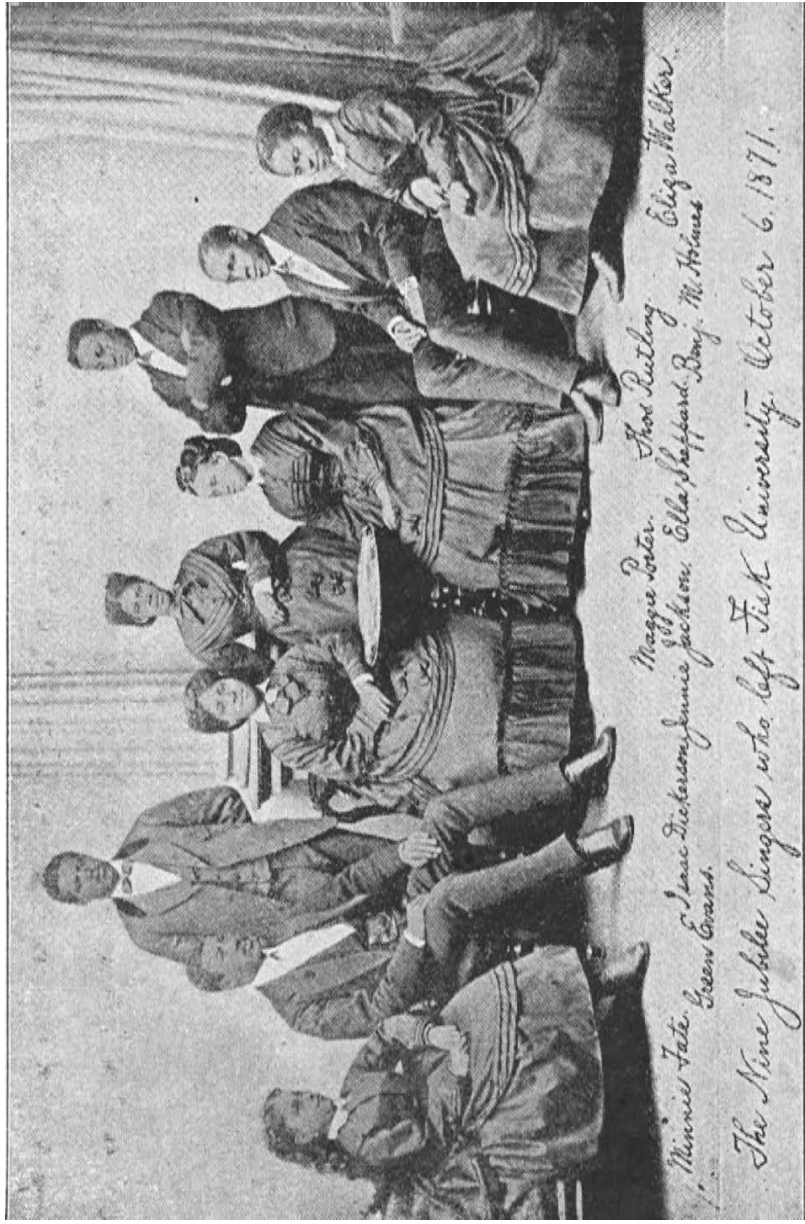
Photo 2.1. The Fisk Jubilee Singers.