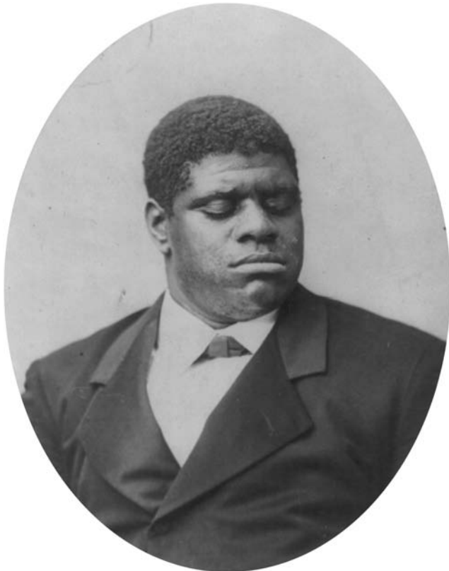
Photo 2.2. Piano virtuoso Thomas Greene Wiggins, billed as “Blind Tom” Bethune.