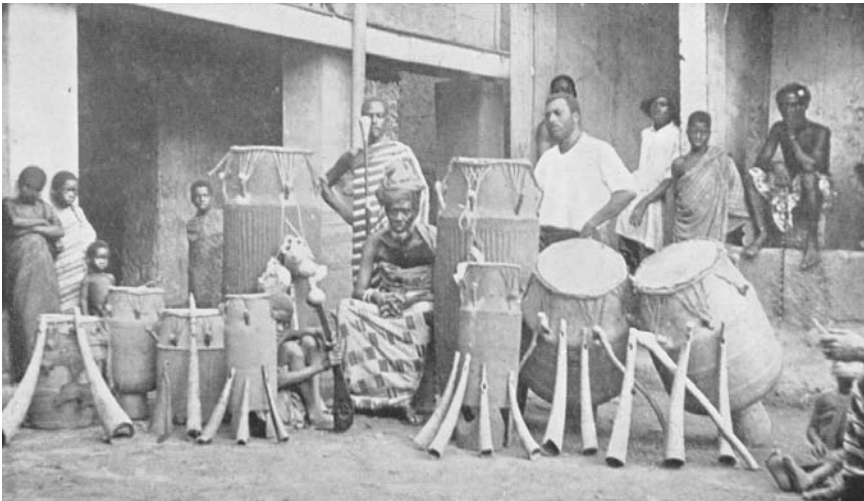
Photo 1.1. An ensemble of traditional West African musical instruments, photographed in the early 1900s.

The centrality of dance helped to shape the extraordinary rhythmic qualities of the music. West African music and dance both display what schol-